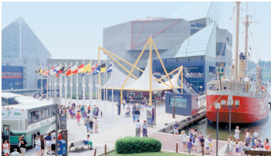
At the National Aquarium in Baltimore, Polygon helped the contractor dry out wet concrete quickly, improving adhesion and keeping the project on schedule and on budget.

The contractor accelerated drying time using heaters in combination with dehumidifiers. However, care was taken not to over-dry the concrete in the process of combining the technologies.